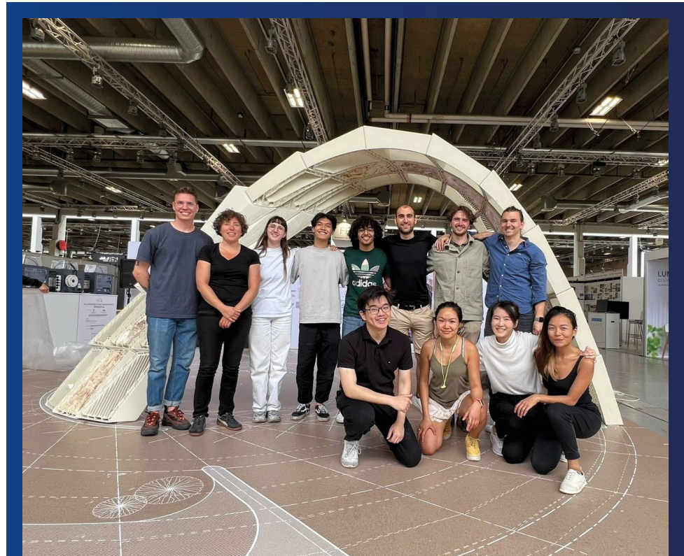
(Picture at the UIA Congress for Architecture in Copenhagen, July 2023. In front of the MSHRM pavilion I contributed to.)

The thesis and the internship may be done in collaboration with the same company or institution. However, the thesis and the internship must have clearly defined and distinct deliverables and learning outcomes, and they will be evaluated separately.